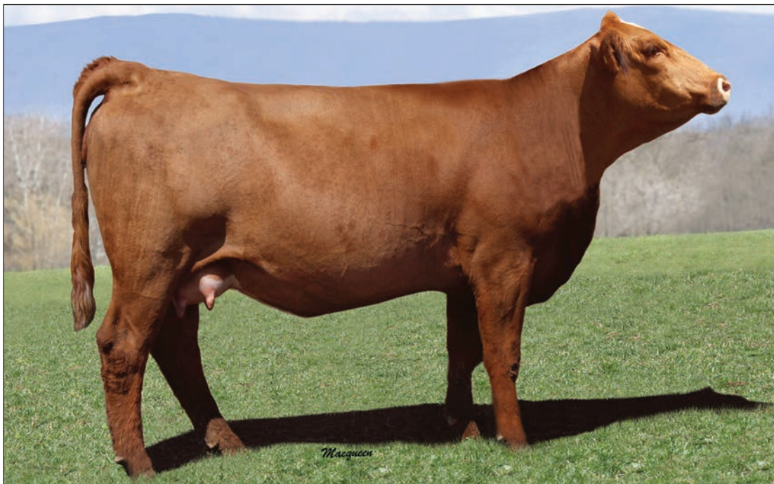
SVS Rose Garden EA9D/Lot 2