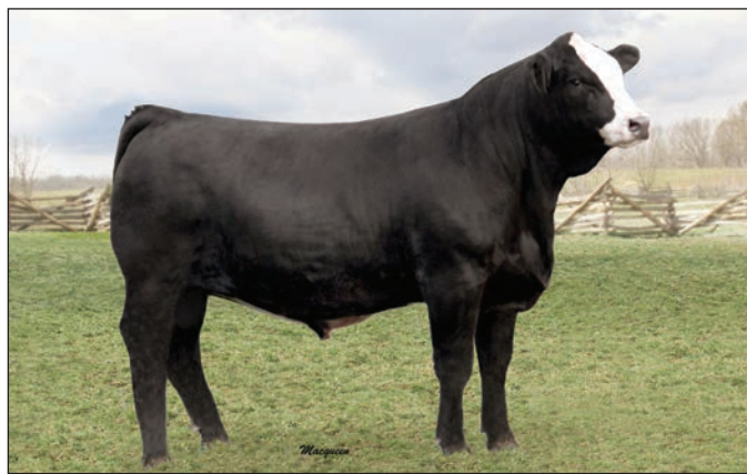
SVS Snowy River FBR7/Lot 119