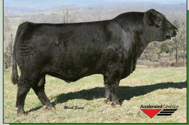
SVS Badlands BSNL / ASA# 2947416 TJ Sharper Image 809U x SVS Sugar-N-Spice SNL2