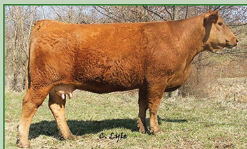
COTT Red Silk 887H / ASA# 1975403 BBS Zima D55 x Nichols Beat 85U