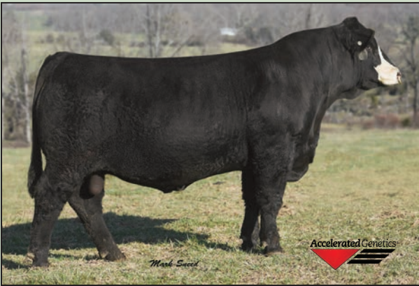
SVS Rawhide BXPZ / ASA# 3000007 MR NLC Upgrade U8676 x SVS Song Bird XPFZ