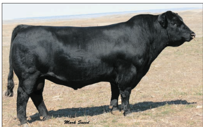
TJ SHARPER IMAGE 809U /Paternal Grandsire of Lot 107