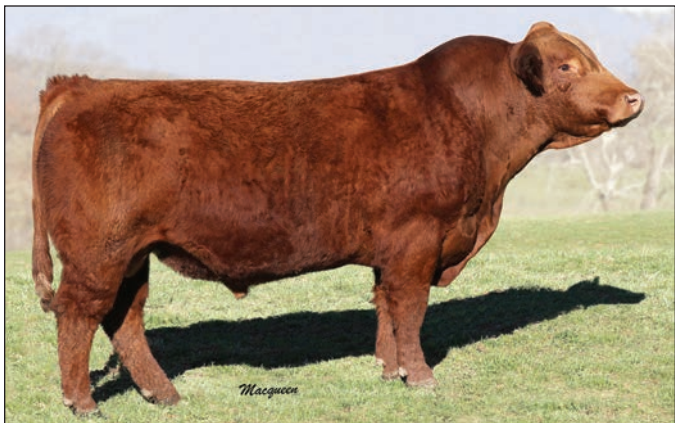
SVS Sundance CWSA/Sire of Lots 110, 119 &amp; 122