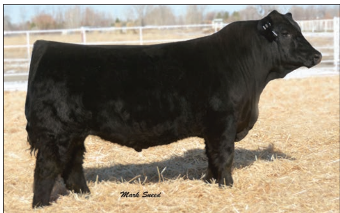
LRS ELEVATE 213B /Sire of Lots 3 & 108