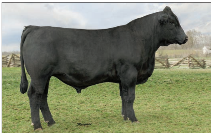
SVS Triple Threat FWSB/Lot 115