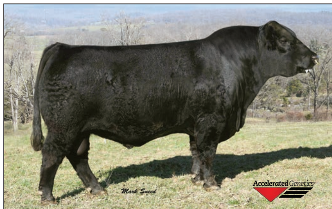
SVS Badlands BSNL /Sire of Lots 101, 106, 107 & 125