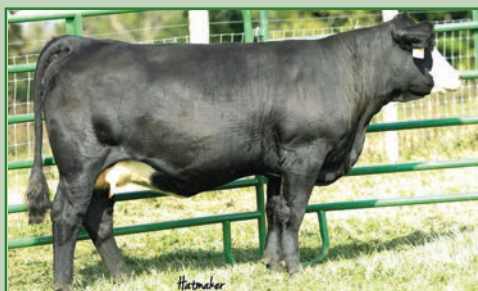
SVS Lily XS19 / ASA# 2591380 SVS Humdinger TR21 x SVS Sarah S19K