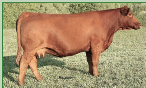
SVS Brown Sugar WS8A / ASA# 2542863 GWS Ebony's Trademark 6N x SVS Sea Wind S87A

Contact us today for mating descriptions and embryo availability!