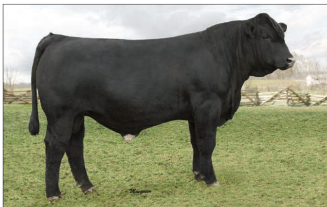
SVS Whiskey River FA33/Lot 126

Top 2% BF; 4% YG; 20% WW; 25% MWW; 30% YW, DOC.