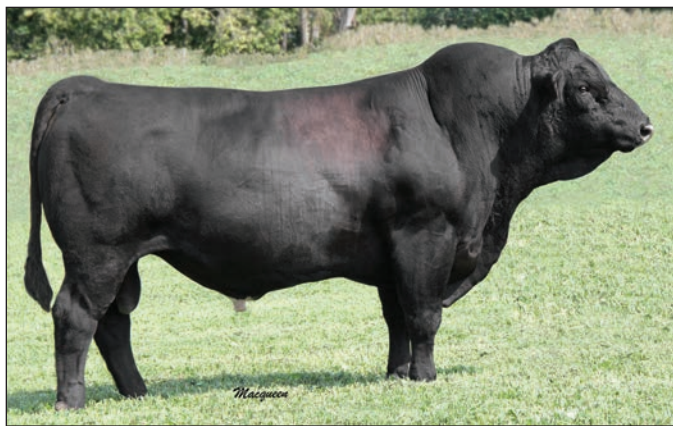
SVS RELOAD WPF7 /Sire of Lot 9

Top 10% WW, YW, ADG, MWW; 20% BF, 25% MK; 30% YG.