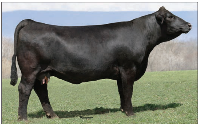
SVS Sofia AXM1/Lot 7