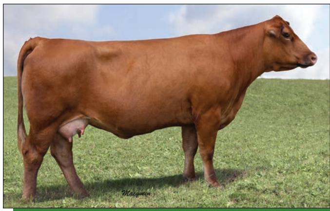
SVS GINGER ZJZ2/Dam of Lot 129