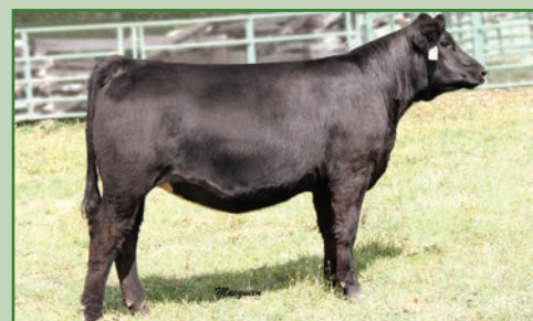
SVS Virginia Belle ASHA / ASA# 2875215 MR NLC Upgrade U8676 x SVS Scarlet SH2A

Embryos and flush opportunities available from these leading ladies and many other proven donors that call home to Shenandoah Valley Simmentals.