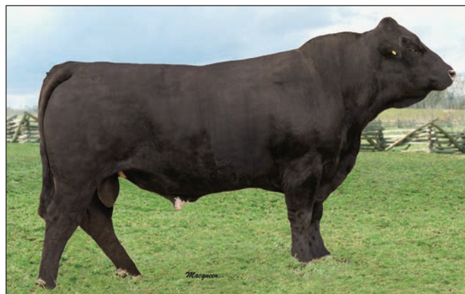
SVS Maverick CXPZ/Sire of Lot 124