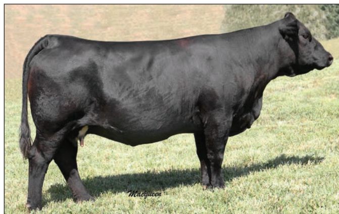
SVS Rhinestone R878/Maternal Granddam to Lot 15

Top 10% STY; 15% MK; 20% BF; 25% BW, YG.