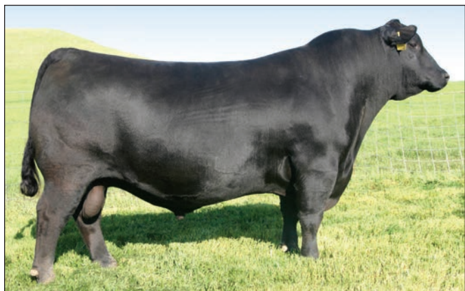
S A V PIONEER 7301/Sire of Lot 128