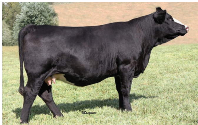
SVS Right As Rain ASOA /Dam to Lot 110

Flashy, flashy, flashy red fire ball! Here's the only red bull in the offering, and folks, he's a good one! Here's a calving ease bull that has it all...performance and looks. SVS Fire Ball is a natural calf of one of our most impressive donors, SVS Right as Rain. Combining this maternal lineage with SVS Sundance produced this exciting package. Although he's one of the youngest bulls being offered, this black-nosed sire is very complete in his make-up and data. He's as thick as they come, deep, extremely correct on his feet and legs, and is just plain fancy. This versatile bull should produce calves that excel in growth and daughters that are drop dead gorgeous. Here's a special chance to tie into a red bull who should do you all kinds of good! Top 20% STY, BF.