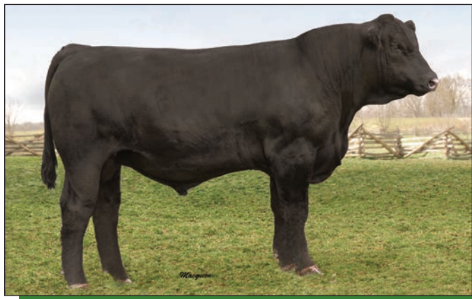
SVS Double Trouble FANH/Lot 113