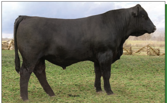
SVS Fast Draw /Lot 101