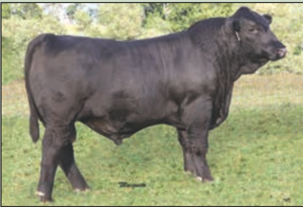
SVS Rocky Top CX9C / ASA# 3137061 WS All-Around Z35 x SVS Lily XS19