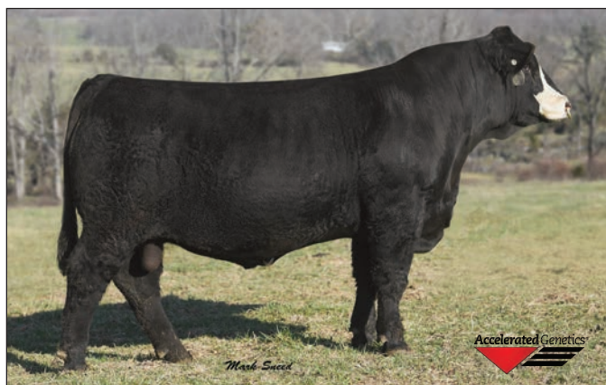
SVS Rawhide/Maternal Sib to Lot 100