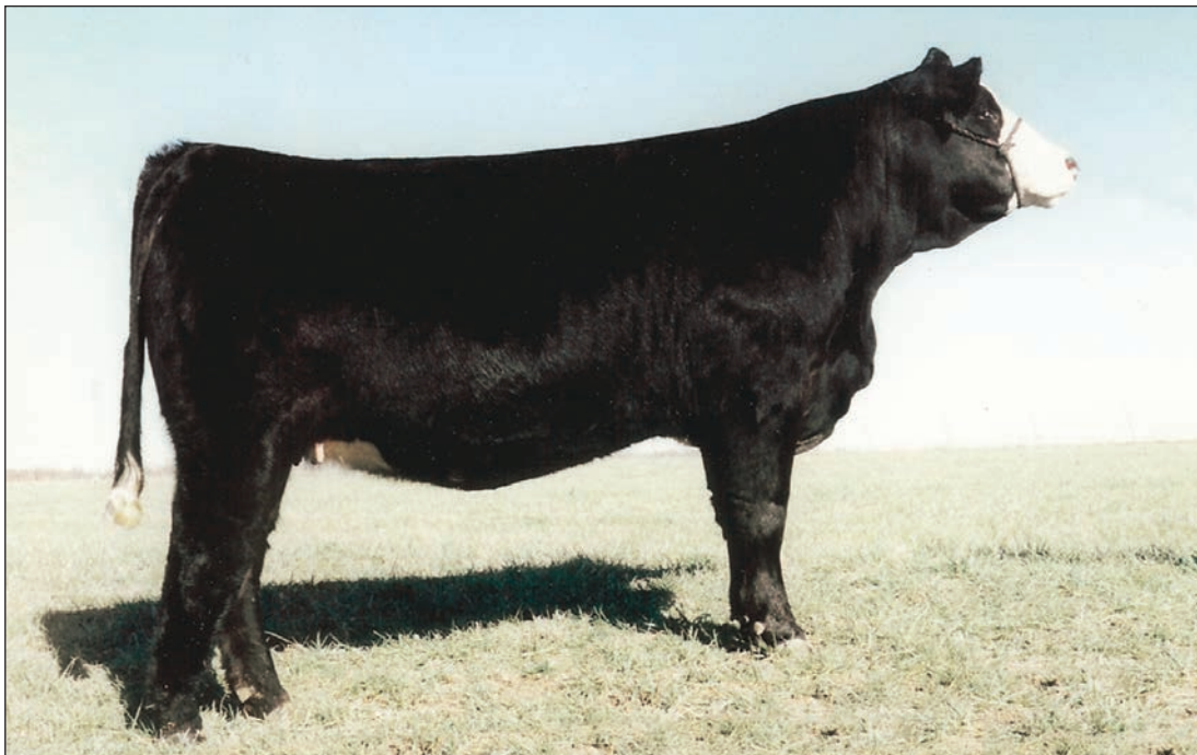
PVF-BF BG10 DOLL BE22/Dam – Granddam to lots 7-12 &amp; 122-124