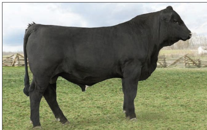
SVS Rev It Up FCX7 /Lot 104

Top 1% DOC; 10% YW, ADG, MWW; 15% WW; 20% YG, BF; 25% MK.