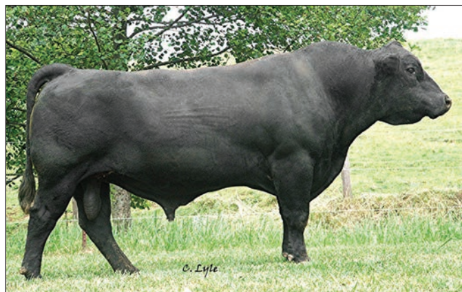
SVS KEEP DREAMIN RNB1/Sire of Lots 8A, 14 & 19