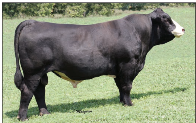
SVS Milestone ZSP7/Sire of Lots 18 &amp; 21