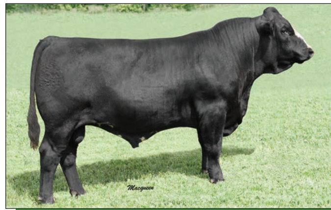
SVS Reveille BU09/Sire of Lots 4, 5, 11 and 15

Black DOB: 9/4/16 ASA# 3275095 Tattoo: DBS9