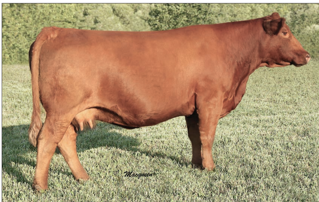
SVS Brown Sugar WS8A/Dam to Lot 114