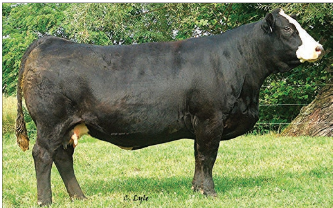
SVS What a Doll MB10/Granddam to Lots 123 &amp; 124