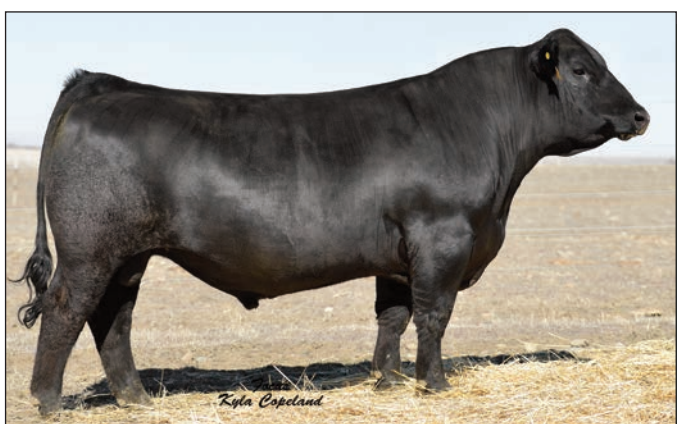
CLRS After Shock 604A

Grandsire of Lots 1, 7, 18, 21, 100, 103 &amp; 107