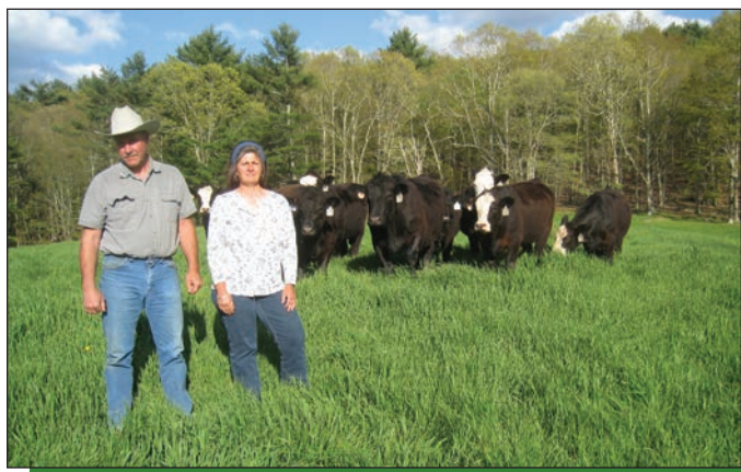
Checking heifers at the mountain farm.

Top 10% BF; 20% WW, YW, YG; 25% ADG, MWW, CW, REA.