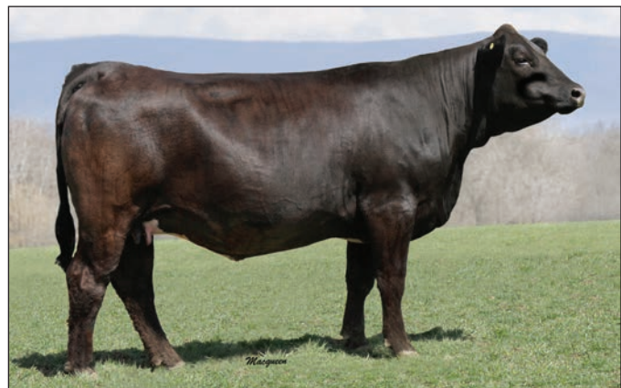
SVS Mulberry DSHA/Lot 22