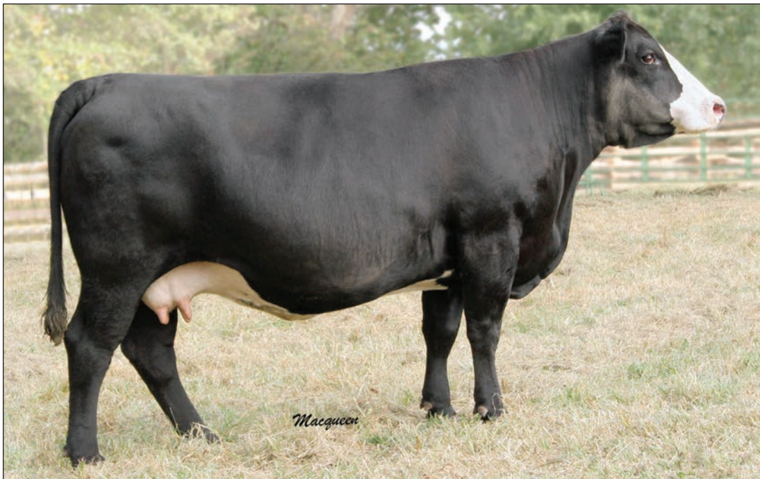
SVS Sandy S019/Granddam of Lots 3, 109 &amp; 110