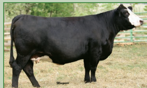
SVS Snickerdoodle US09 / ASA# 2494168 SVS Keep Dreamin RNB1 x SVS Sandy S019