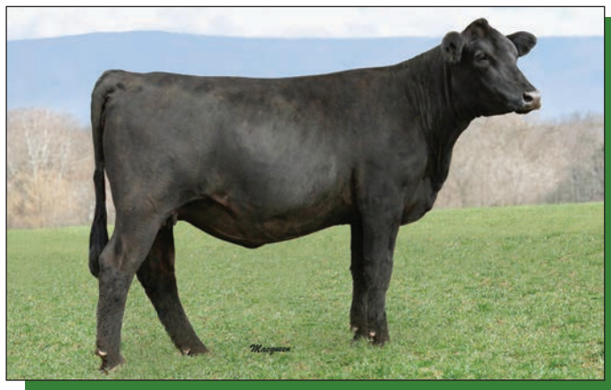
SVS Prudence EZUL/Lot 13