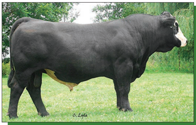
SVS Humdinger TR21 /Maternal Grandsire to Lot 103

Every farmer needs a hound! Cheese, found in a steel leg trap, is definitely the cat's meow!!!