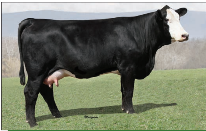
SVS Summer Dream DBS9/Lot 3