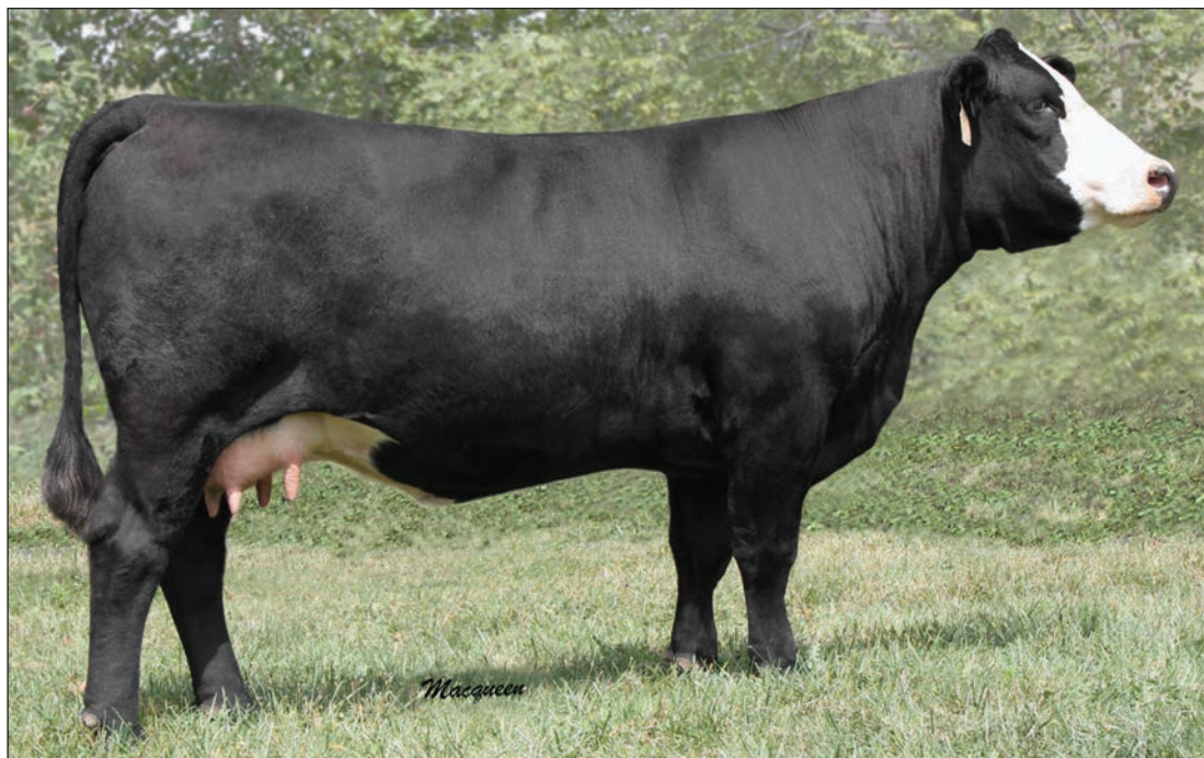
SVS Lily XS19 /Dam of Lot 107