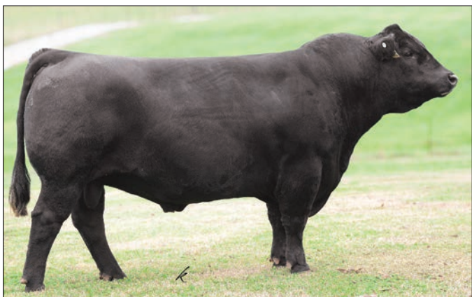
GIBBS Bullet Proof 2654Z/Sire of Lot 118