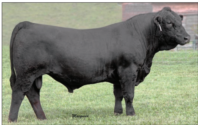
SVS Sniper BM10/Sire of Lots 104, 114, 121 & 133