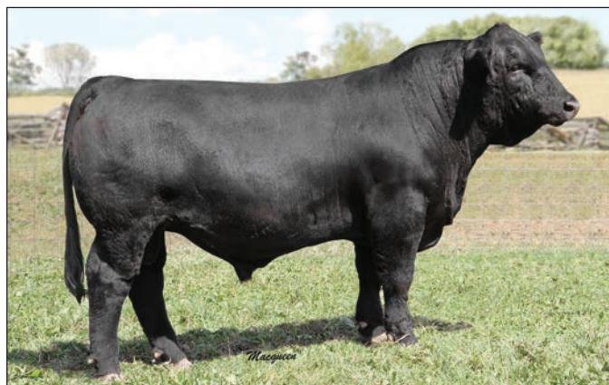
SVS PATRIOT CXT7/Sire of Lots 109, 115, 126, 127 & 130