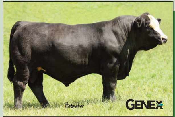
SVS King Pin YU09 / ASA# 2650864 SRS Right-On 22R x SVS Snickerdoodle US09