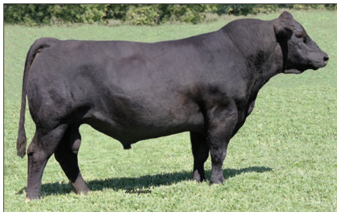
SVS Shenandoah ZWNA/Sire of Lots 13, 26, 120, 131 & 134

Top 3% YG; 10% BF; 15% CE; 20% REA; 25% MCE.