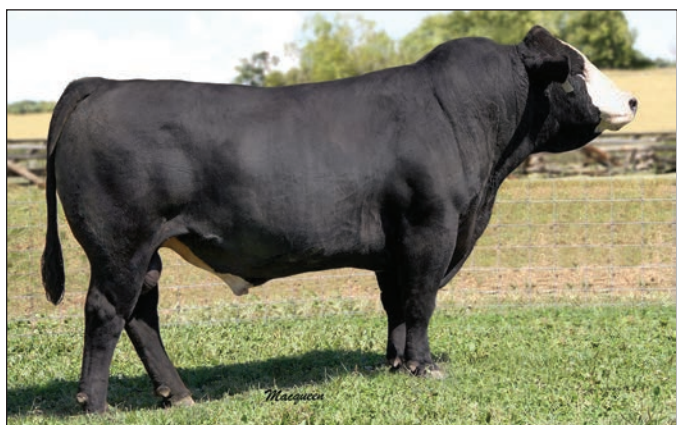
SVS Bell Ringer ANL3/Sire of Lots 110 &amp; 112