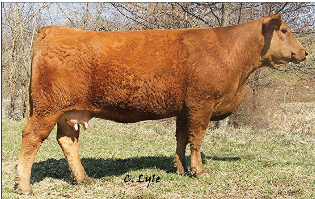
COTT Red Silk/Dam-Granddam to Lots 14 - 15A, 111 - 114