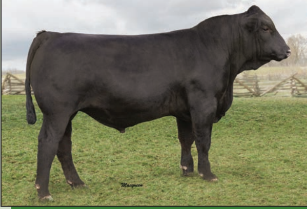
SVS Everclear FAR2 / ASA# 3546110 WS All-Around Z35 x SVS Spellbound ARK2