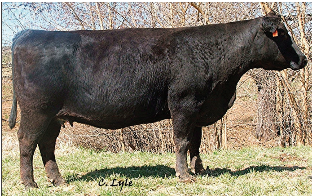
SVS Pansy PLF7/Dam to Lot 101