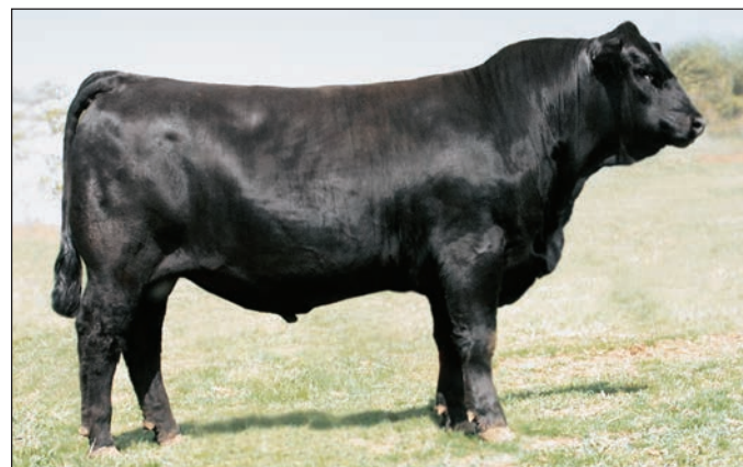
BF K065 Talladega /Sire of Lot 105