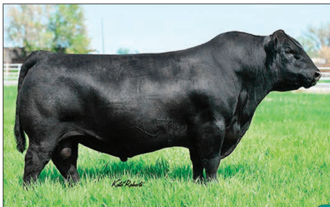
MAR INNOVATION 251 /Sire of Lot 10