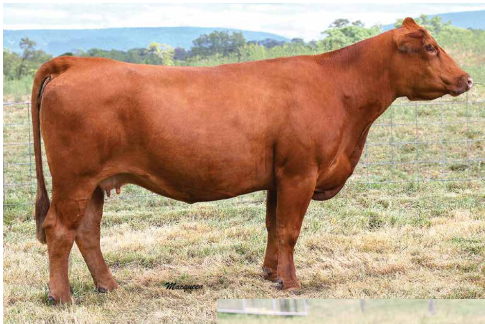
SVS ROSES R RED CALH sells as Lot 2.

Top 25% CE - Top 35% WW - Top 35% YW Top 10 % MCE - Top 3% Stay - Top 15% REA - Top 10% $API - Top 20% $TI One of the very best red star-faced females you will find. Ravishing Ruby is certainly one that is hard to part with and will have the brightest of futures. Physically she is powerful, bold-bodied, and is always one that quickly catches your attention. She combines her massive build with an outstanding EPD profile. Her Cowboy Cut son, Cripple Creek, sells as Lot 69. The proof is in the pudding. We are confident this Prime Beef daughter will be a cornerstone breeding piece at her new home.