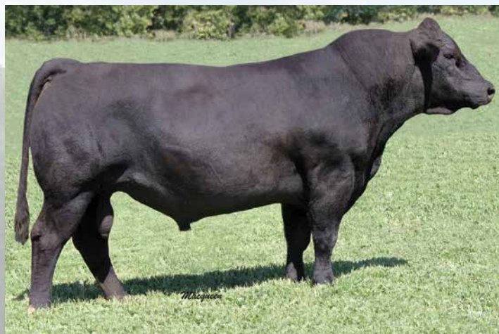
SVS SHENANDOAH ZWNA sire of Lot 93.

Perfect Storm is the right kind of herd sire. He's homozygous black and homozygous good! Reluctantly, we're offering his dam, Melody, a Humdinger granddaughter, as Lot 4. Those of you who follow our program know the positive impact Humdinger genetics have had on our herd. If you are looking for a herd sire to add growth take a strong look at this After Shock son. Performance and power run deep in his genetics.