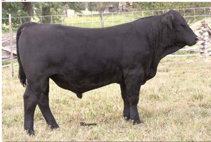
SVS PEG LEG FRM8 sells as Lot 68.