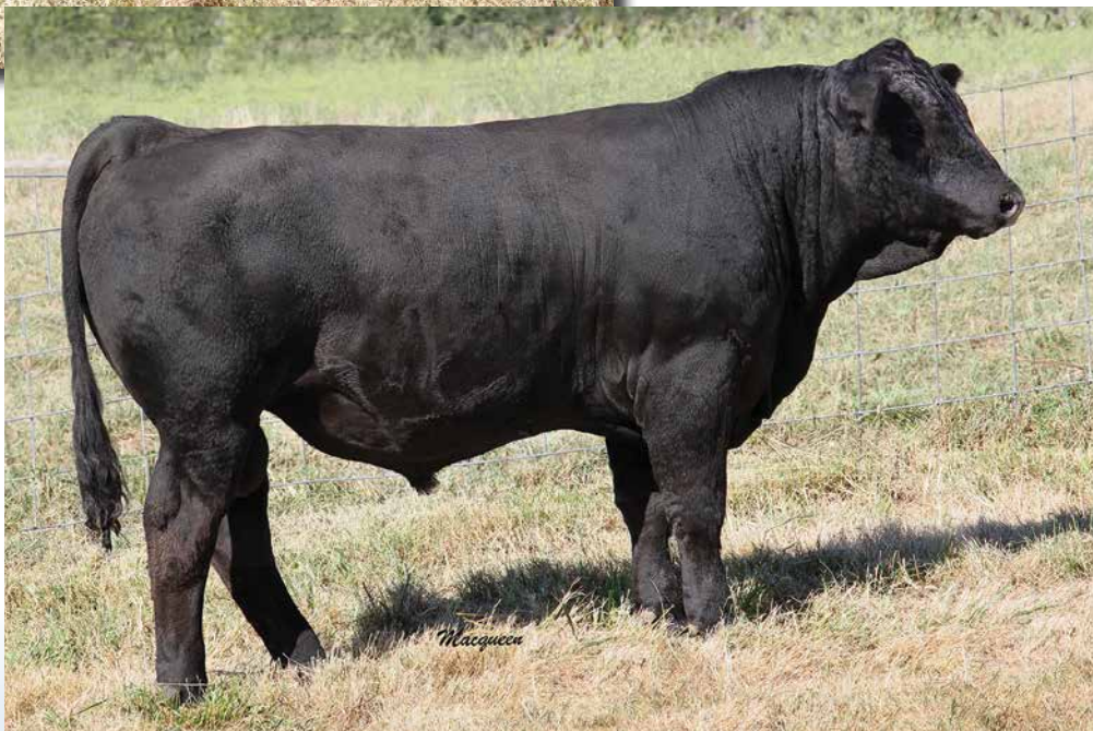
SVS SHIFTIN' GEARS FYUD sells as Lot 51.

Homo Black Polled 1/2 SM 1/2 AN Bull ASA 3578643 FZWB BD: 10/11/2018