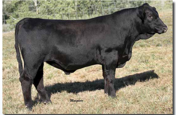
SVS HIGH COUNTRY FA35 sells as Lot 57.

High Country is a powerful Hook's Yellowstone son that will be a tremendous breeding piece for any operation. He is another purebred bull in our offering that offers lots of growth, power and maternal ability. His dam is a beautiful Reload daughter whose maternal granddam, Cardinal, was an outstanding donor. These genetics are designed for profit.