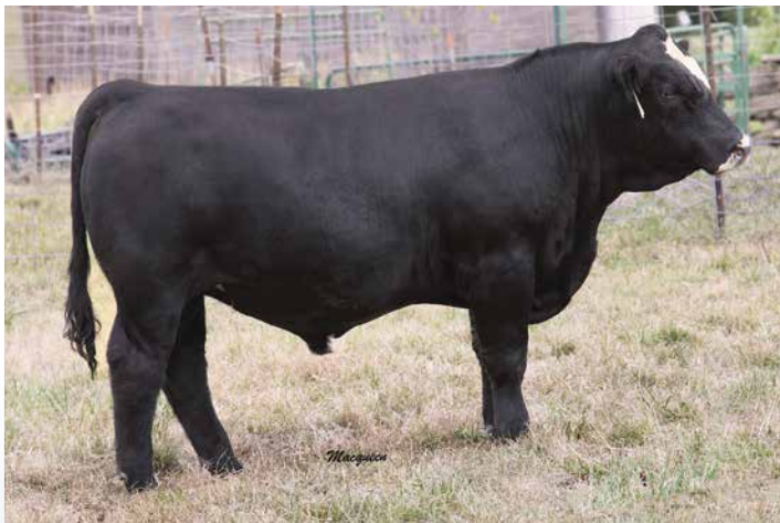
SVS REST EASY FU09 sells as Lot 64.