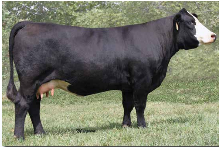
SVS LILY XS19 maternal grandam of Lot 84.