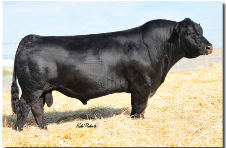
OVAL F ALL TIME A322 sire of Lot 52.