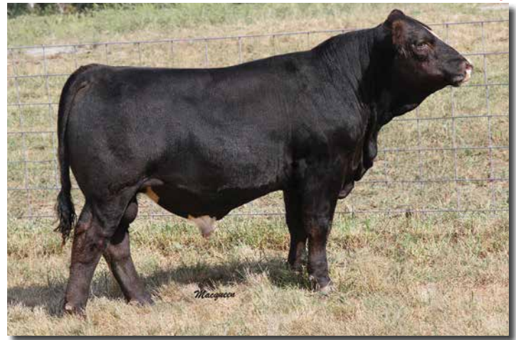
SVS FAIR SHAKE FDN1 sells as Lot 79.