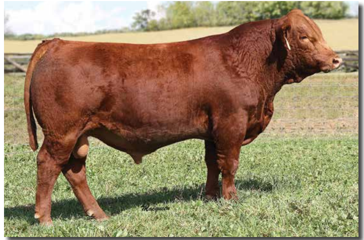
SVS SUNDANCE CWSA sire of Lot 70.