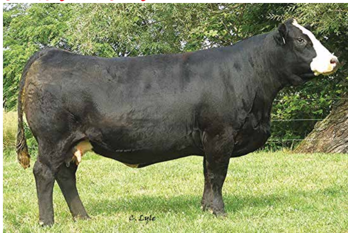
SVS WHAT A DOLL MB10 maternal grandam of Lot 10.