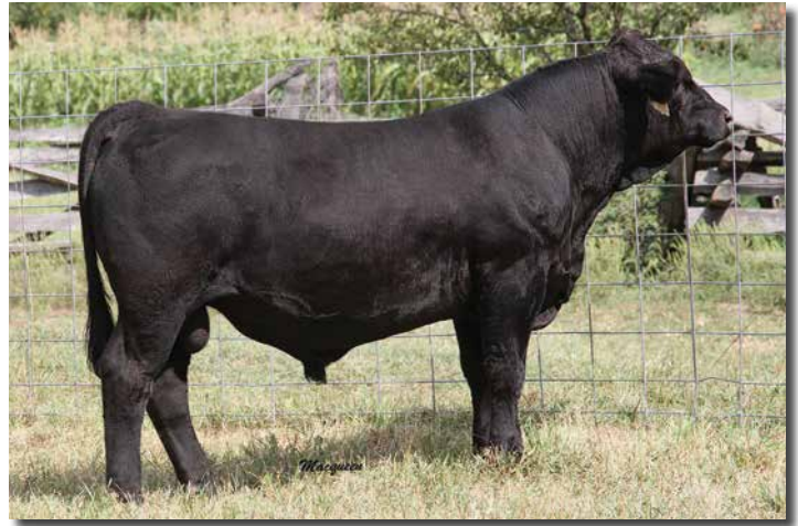
SVS LONE RANGER FZSL sells as Lot 66.