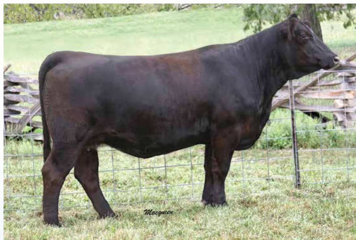
SVS POPCORN EXT8 sells as Lot 12.