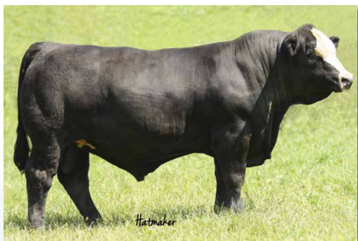
SVS KING PIN ASA 2650864