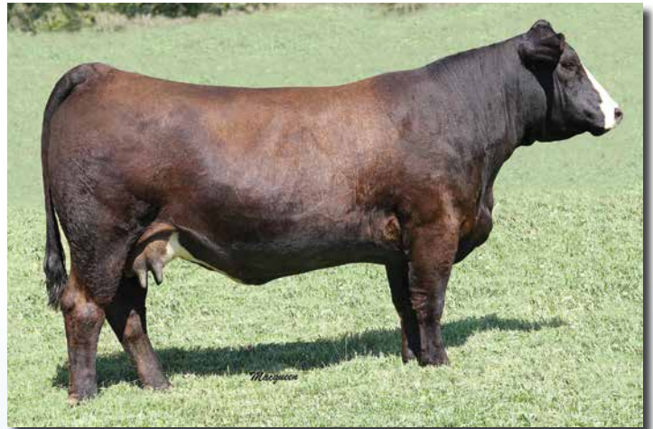
SVS RHINESTONE ZPLD dam of Lot 60.