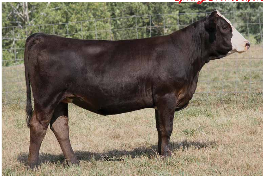
SVS EBONY & IVORY FAP7 sells as Lot 23.