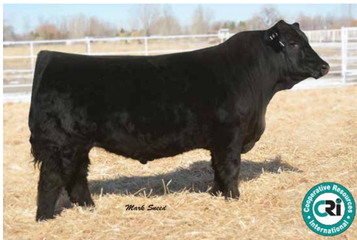
LRS ELEVATE 213B service sire of Lot 27.