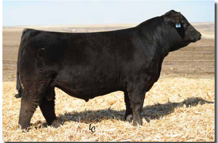
CCR COWBOY CUT 5048Z sire of Lot 67.

Cow Family: Virginia Belle/Black Vanessa