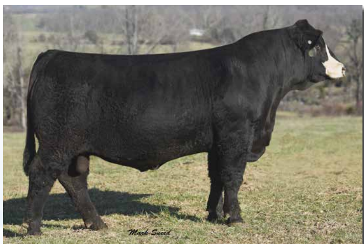
SVS RAW HIDE ASA 3000007