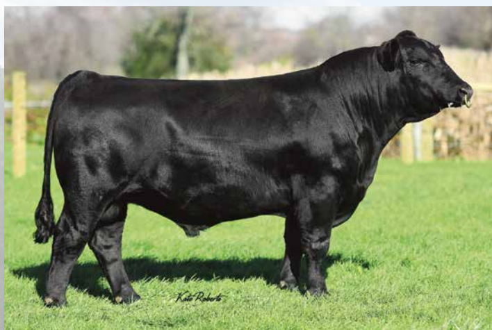
JC ENGINEER 102C service sire of Lot 16.