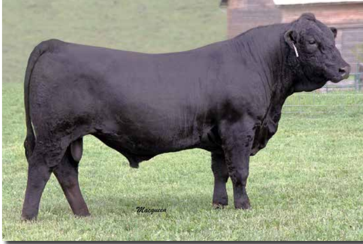
SVS SNIPER BM10 sire of Lot 91.