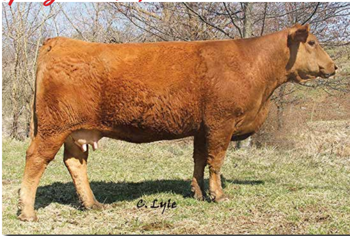
COTT RED SILK Lot 24 and 25 cow family.