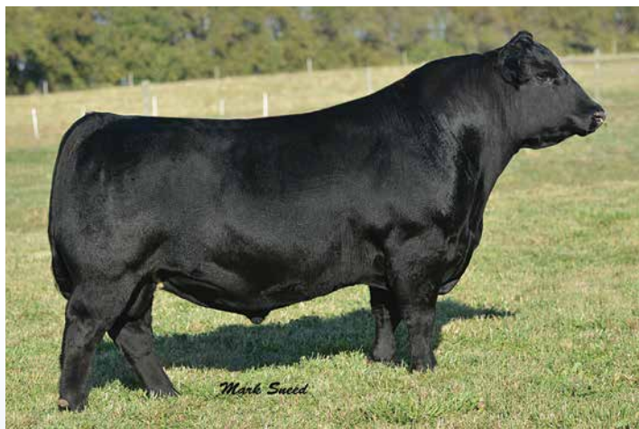
PVF INSIGHT 0129 sire of Lot 68.