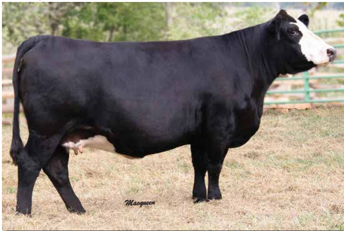
SVS SNICKERDOODLE US09 dam of Lots 63, 64.