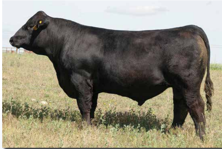
CLRS AFTER SHOCK 604 A sire of Lot 92.

The Sniper sons will be sure to impress on sale day. Double Shot backs his strong maternal predictors with tons of visual performance and stoutness. Use this homozygous black, blaze-faced herd sire on purebred or commercial cows to help keep your calves from getting lost in a sea of black on sale day.