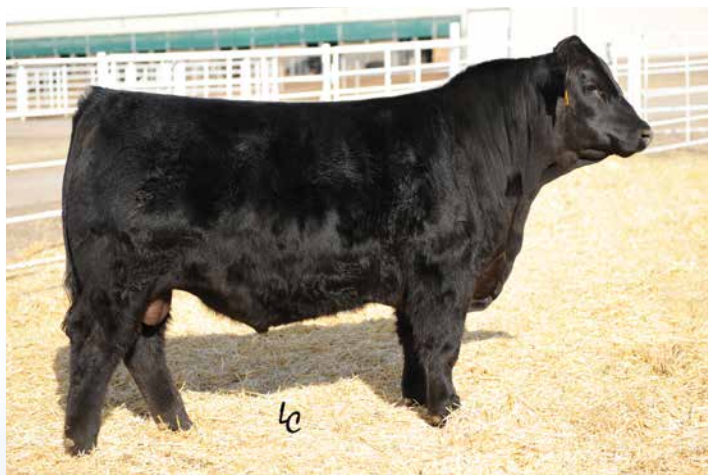
WS ALL-AROUND Z35 sire of Lot 15.