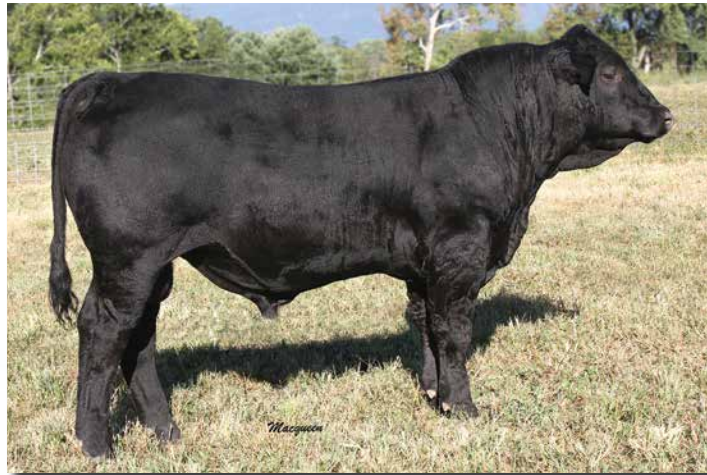
SVS BACK COUNTRY FWP7 sells as Lot 80.