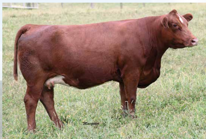
SVS RAVISHING RUBY CZTM dam of Lot 69.