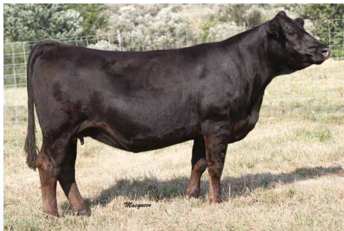
SVS CHICKADEE DYND sells as Lot 5.