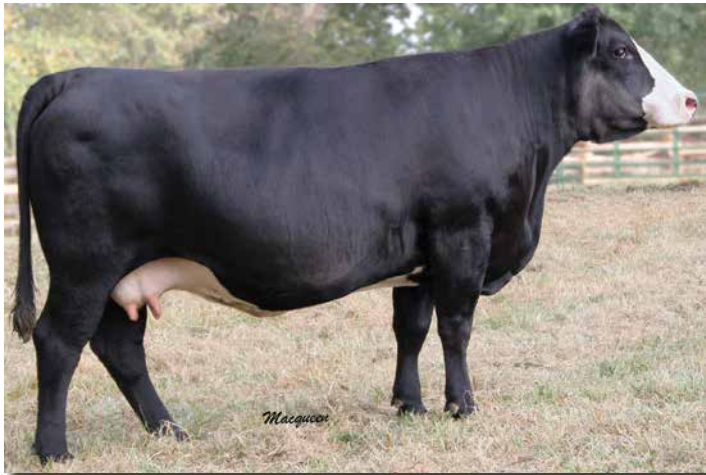
SVS SANDY S019 maternal grandam of Lot 61.