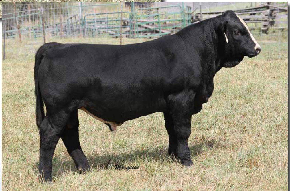
SVS NEW FRONTIER FR1J sells as Lot 55.

Homo Black Polled PB SM Bull ASA 3578638 FBZJ BD: 9/14/2018