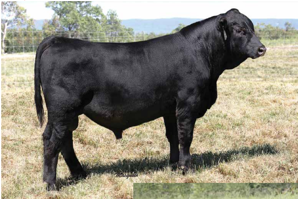
SVS HEADLINER FZWB sells as Lot 50.

Top 5% WW - Top 10% YW - Top 10% MCE - Top 20% Milk - Top 4% Stay - Top 10% Doc - Top 10% API - Top 10% $TI