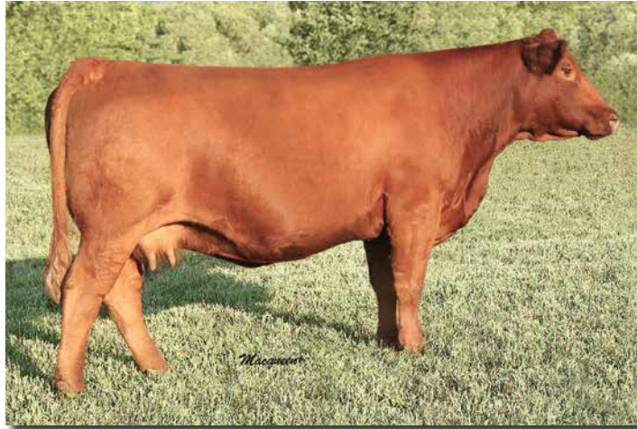
SVS BROWN SUGAR Lot 72 cow family.