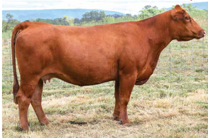
SVS ROSES R RED CALH dam of Lot 17.