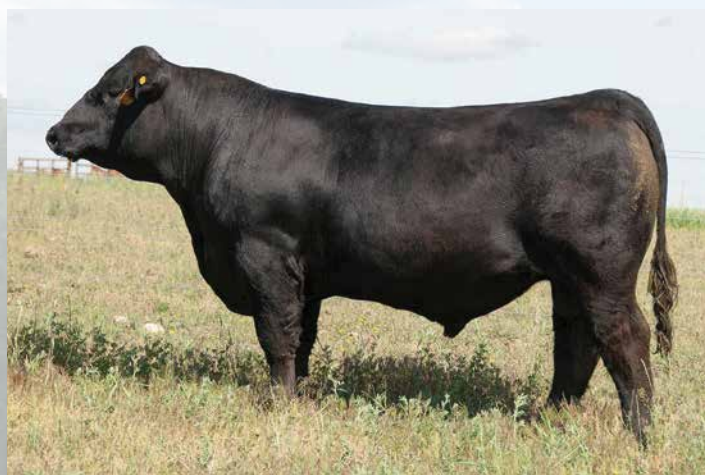
CLRS AFTER SHOCK 604 A sire of Lot 6.

Proven AI sires are on both sides of this young standout's pedigree. This Aftershock female offers an immense amount of length and power. Opal is homozygous black and homozygous polled. We showed her maternal great granddam, Jana, quite competitively at the Denver National Stock Show and what a grand time we had! Purebred females with this much quality are hard to find and would be a great addition to any herd.