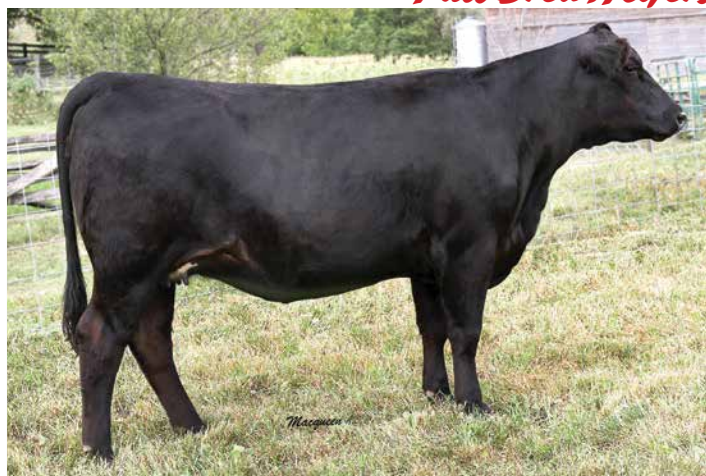
SVS REMINISCING EYSZ sells as Lot 11.