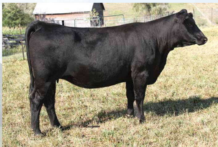
SVS LEMONADE ERF2 sells as Lot 13.