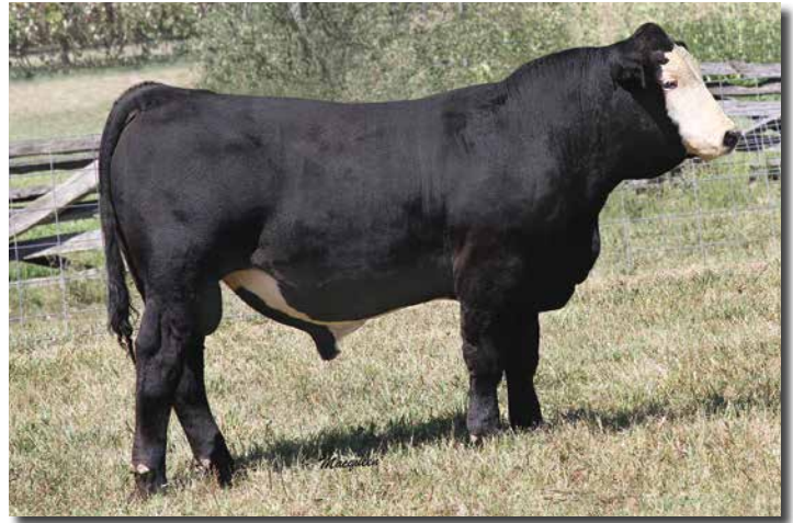
SVS HANG`EM HIGH FZPD sells as Lot 60.