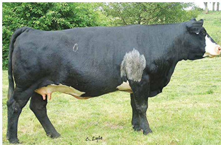
SVS KELBY Lot 7 and 8 cow family.