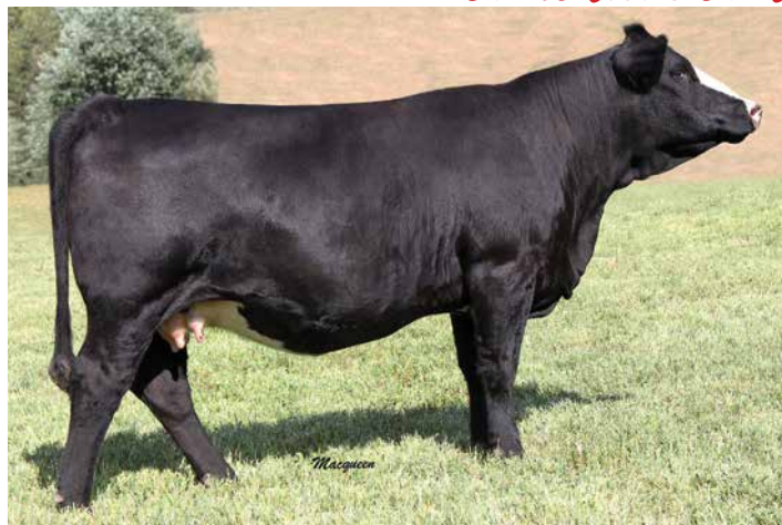
SVS RIGHT AS RAIN Lot 7 cow family.