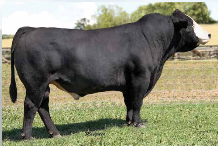
SVS BELL RINGER ANL3 sire of Lot 77.