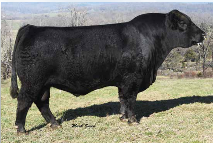
SVS BADLANDS maternal brother to Lot 65.