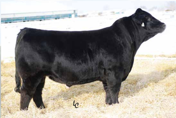
ASR AUGUSTUS Z2165 sire of Lot 53.