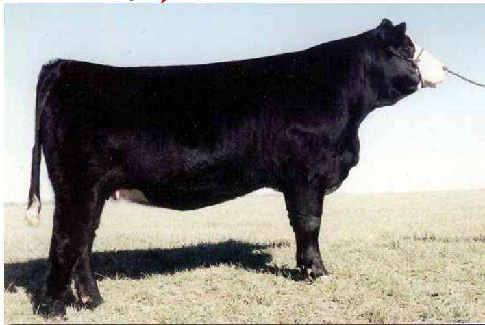
PVF-BG DOLL Lot 14 cow family.