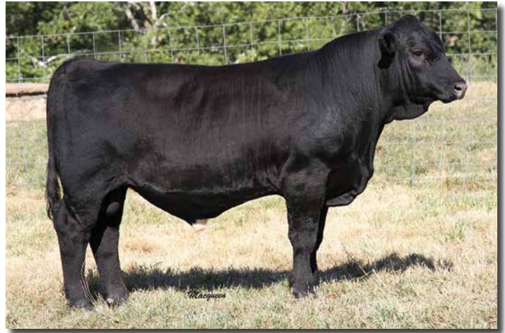
SVS WOODEN NICKEL FCU1 sells as Lot 52.