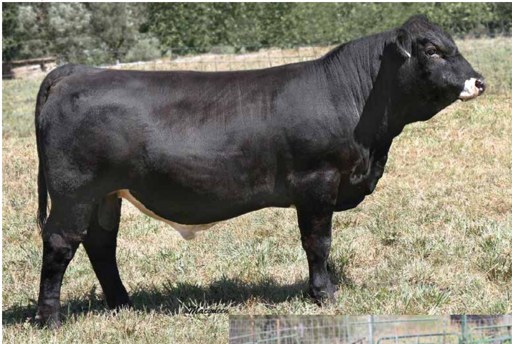
SVS LIGHTNIN' STRIKE FBZJ sells as Lot 54.