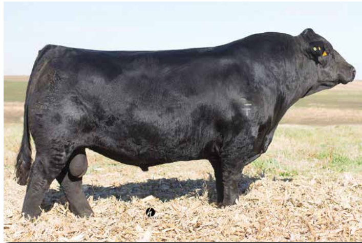
GIBBS 3009A ELEMENT sire of Lot 89.