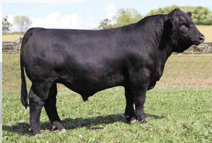
SVS PATRIOT CXT7 sire of Lot 19.