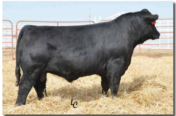
HOOK'S YELLOWSTONE 97Y sire of Lot 87.