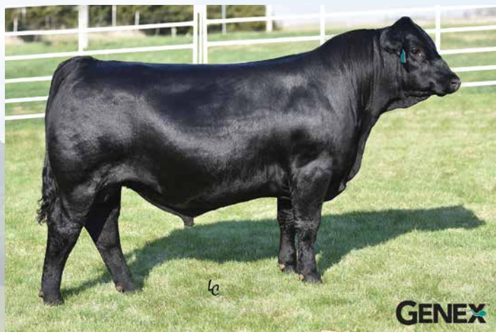
BBS TRUE JUSTICE B10 service sire of Lot 30.