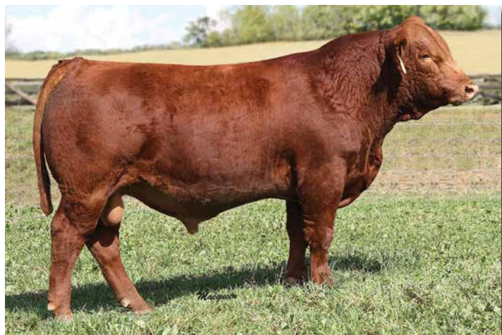
SVS SUNDANCE ASA 3137055