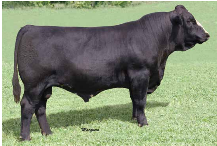
SVS REVEILLE BU09 sire of Lot 74.