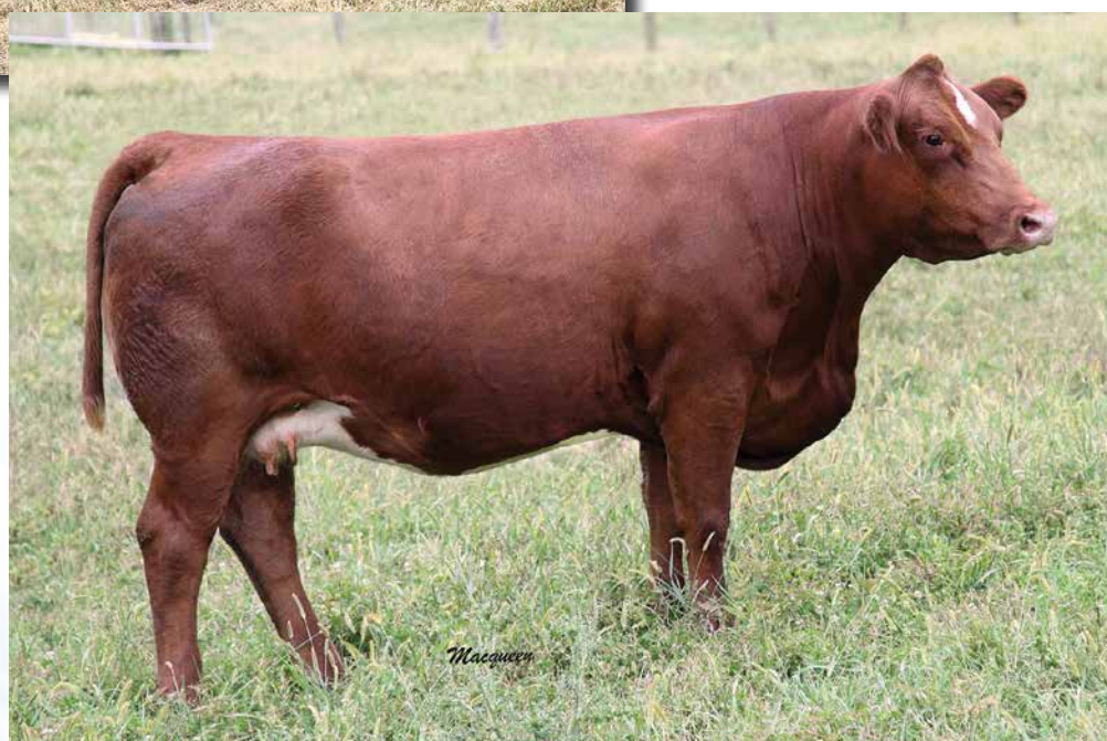
SVS RAVISHING RUBY CZTM sells as Lot 1.

Red Polled PB SM Cow ASA 3136954 CZTM BD: 9/18/2015